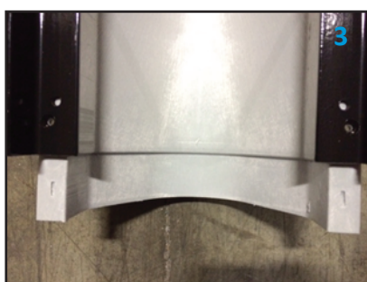
3. The countersunk holes in the frame will now line up with the holes in the channel.