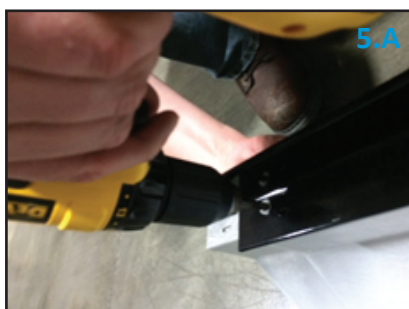
5. Hold nut with fingers, tighten bolt until secure. Repeat for all counter sunk hole on frame.