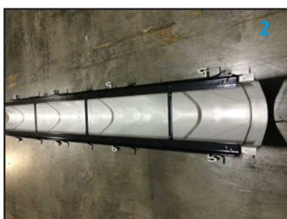
2. Lay Frame on Channel. Position frame so it does not cover the female end of channel.