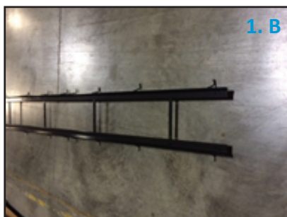
1. Part B - P882-HDF/HDG/HDS Frame