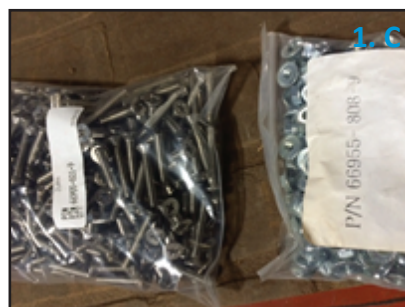
1. Part C - PN# 669558089 Assembly Nuts PN# 669558219 Assembly Screws