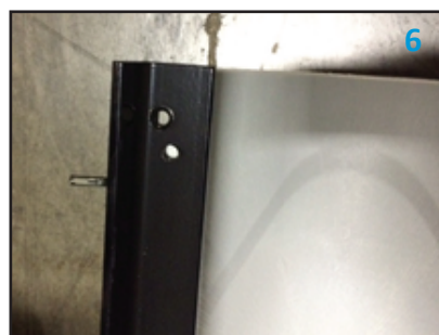
6. If this channel is to attach to the next channel in the run, do not insert bolt until it is attached to the female end of the next channel.