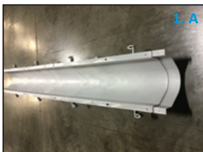
1. Set out Parts Part A - Z882 Channel