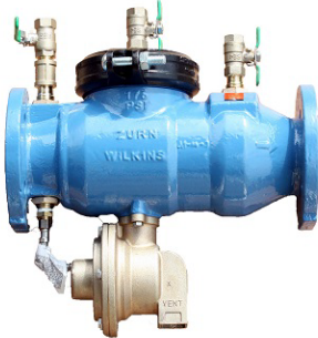
Model 375 Reduced Pressure Principal Assembly

MODEL 375 Reduced Pressure Zone Device 65-250mm