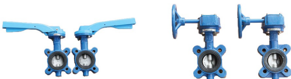
Wafer Gear Operated Butterfly Valves

w/ Y-Strainer & Lugged Gear Operated Butterfly Valves