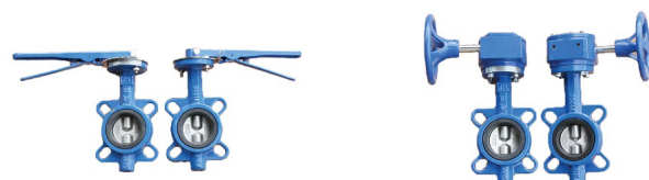
Wafer Butterfly Valves